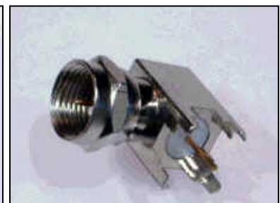
Fig. 131 Fig. 132 Fig. 133 Fig. 135B